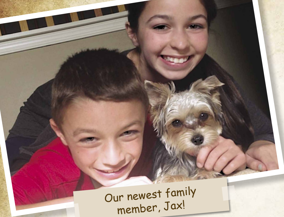
Our newest family member, Jax!